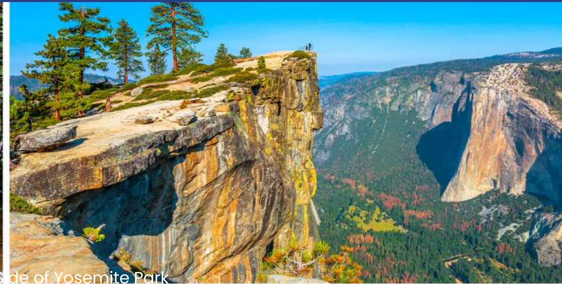
Seldom Explored Side of Yosemite Park