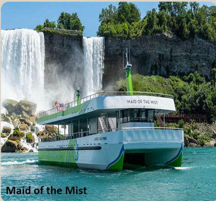
Maid of the Mist