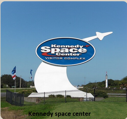
Kennedy space center