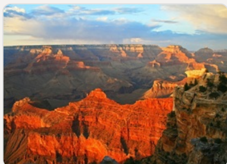
Grand Canyon Las Vegas