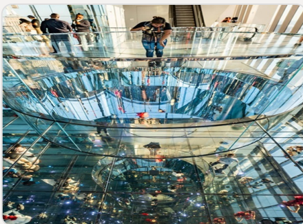
Summit One Vanderbilt